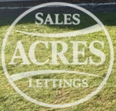
18 POPLAR RISE, LITTLE ASTON B74 4HT